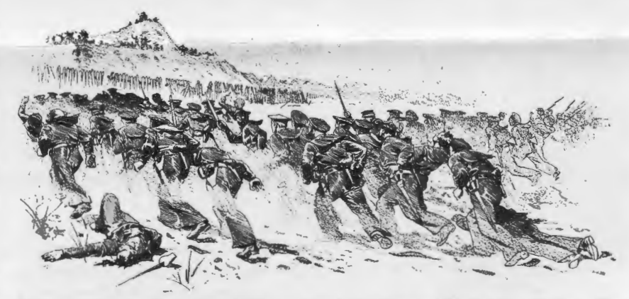
Porter organized an all volunteer 2,000-man brigade of sailors and Marines from the fleet. The assault was a disaster as the brigade attacked the strongest part of the fort armed with nothing more than cutlasses, revolvers and carbines. The attack did distract the Confederate defenders' attention long enough for the Army brigade to breach the main wall on the north side. (1867 engraving from Battles and Leaders of the Civil War)

A few days after the capture of the fort, Wilmington fell to Union forces. Cut off from any outside supplies, Lee surrendered at Appomattox Court House ten weeks