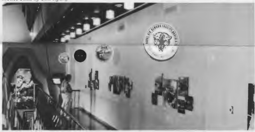
Just outside the museum, is a photo retrospective of the depot's service to the Naval Air Force. Hanging from the ceilings are decals of the different names the depot has used from its beginnings.