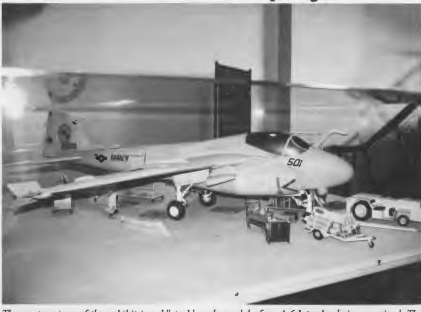
The center piece of the exhibit is a 1" to 1' scale model of an A-6 Intruder being repaired. The model includes everything, from spilled coffee to the tools used to repair the aircraft, that one would see on an airplane being overhauled at NADEP, Norfolk. (model built by Jim Ryan)