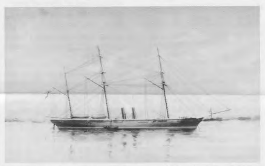
CSS Florida is a prime example of what can happen when a ship wreck is vandalized by souvenir hunters. While a proper archaeological dive was done on the Hampton Roads wreck at a later date and the stolen artifacts recovered, the shipwreck site had been severely abused and many of the artifacts permanently damaged. (U.S. Navy photo of a 1894 drawing by Clary Ray)

Divers may not disturb or remove any portion of a wreck. The urge to take home a souvenir is a major