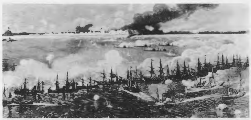
Two weeks after the first expedition against Fort Fisher failed, the U.S. Navy organized a second assault with a new, more cooperative Army general and more ammunition. Shown above is the bombardment of the fort by the Union fleet. Before Army troops finally captured the fort on Jan. 15, 1865, the Union fleet had fired over 70,000 shells, or about 1,464 tons of shot, during the two expeditions. (1867 engraving from Battles and Leaders of the Civil War)