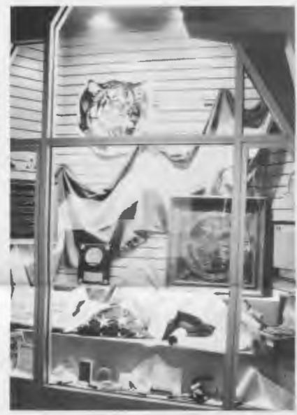
Through artifacts and other memorabilia, the spirit of the "Tidewater Industrial Tiger" lives on. Shown here are several items telling the story of NADEP, Norfolk including the American flag from NADEP, the EPA environmental quality award it received and aircraft work manuals.

Through Jan. 31, 1997, the Hampton Roads Naval Museum is proud to present Without Us... They Don't Fly!: A Retrospective on Naval Aviation Depot, Norfolk. The exhibit showcases the depot's service to the Naval Air Forces over the last 75 years. Among the items on display are pictures dating from the facility's beginnings, a 1" to 1' scale model of an A-6 Intruder and an aircraft sheet metal mechanic's tool case. The exhibit is located on the hallway just adjacent to the museum.